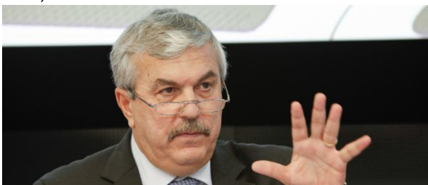
MEP Dan Nica.

Parliament committees fight to preserve sectoral funding in Competitiveness Fund, as rapporteurs brace for up to 15,000 amendments