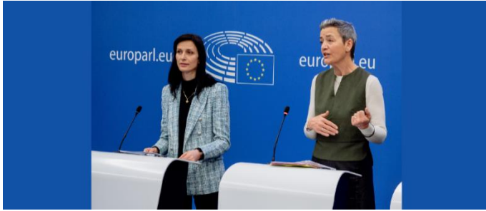
Former Research Commissioner Mariya Gabriel (Left) beside her acting replacement, Commission vice president Margrethe Vestager.

The portfolio of Mariya Gabriel is split in two, with Margrethe Vestager caretaker of R&I until a replacement is appointed. Some question Vestager's interest in research, while others think her experience in competition policy will be a positive for innovation