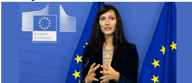
Former Research Commissioner Mariya Gabriel, who officially resigned from her post on Monday.

The EU's Bulgarian commissioner officially leaves Brussels, with a mandate for a difficult task: trying to form a coalition government back home in Sofia after close elections