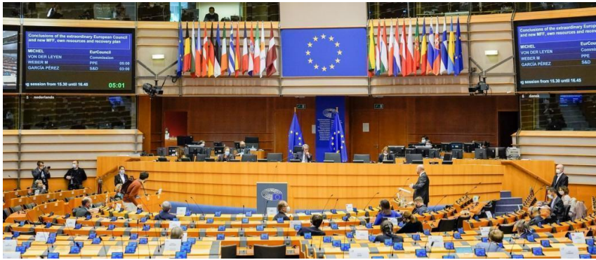
European Parliament.

Next research programme can start on time, and MEPs also manage to claw back money for health and student exchanges. But there's disappointment they didn't salvage more